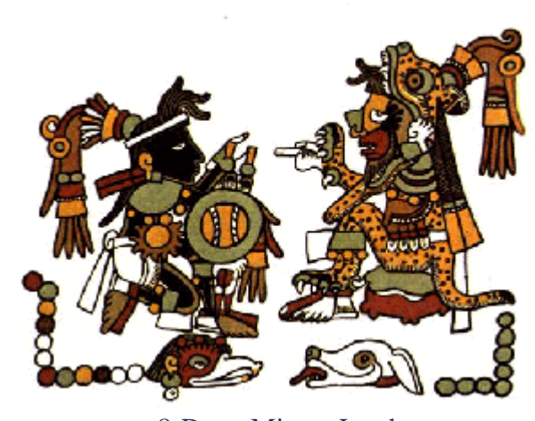
8-Deer, Mixtec Leader

Ocelot Claw—the Mixtec counterpart of the Aztec Mochtezuma.