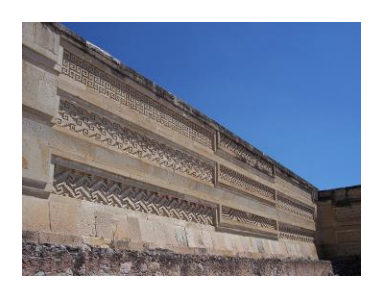
Mitla -- Wikipedia

We'll see more of Mitla—and its great leader Eight Deer Ocelot Claw —in the Postclassic.