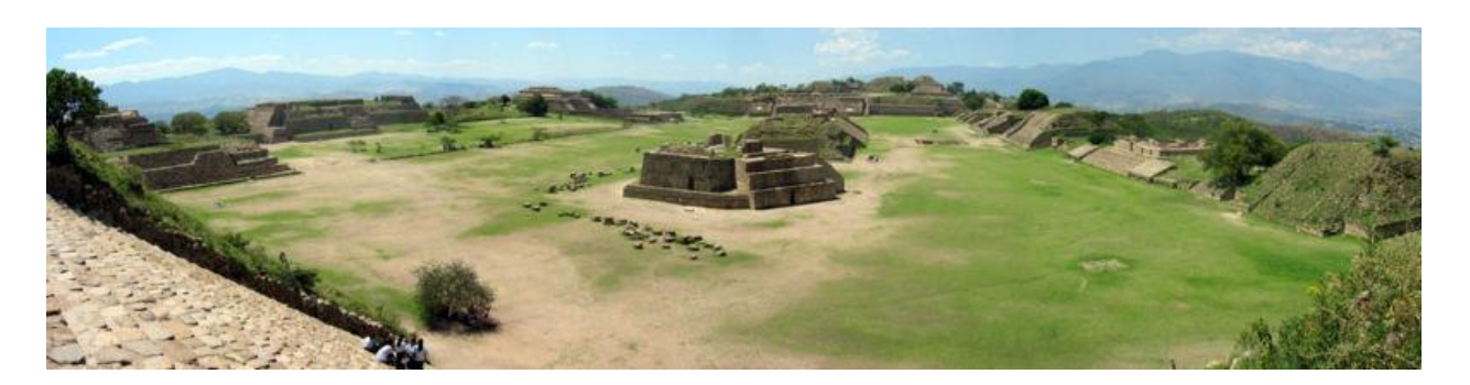
Monte Albán -- Wikipedia

At its peak, in the Classic, Monte Albán was the home of the great Zapotec people and their Empire. It is the flagship site and political and economic center of one of the very few civilizations in the world that lasted almost a thousand years.